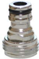
WYS-105 Male Quick Connector