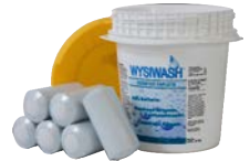
WYS-117 Wysiwash Jacketed Caplets 9-Pack