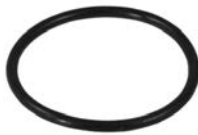
WYS-115 Hydro Seal