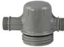
WYS-108 Hydro Body