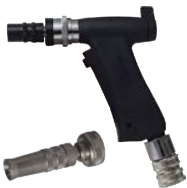
WYS-228 Sanitizer Pro Conversion Kit